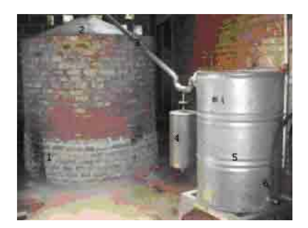
Figure 1. The home-scale convensional apparatus for pyrolysis: 1. Convensional furnace with wood as fuel; 2. Reactor; 3. Smoke flow pipe; 4. Tar condensed collecting; 5. Condenser; 6. Liquid smoke collecting.

The sample of tar was afforded from direct pyrolysis of coconut shell (150 kg), conditions: 250 - 300 °C, 5-6 h pyrolysis, at atmosphere pressure. Smoke resulted was condensed and further distillated to afford two layers product. After left overnight, this layer afforded upper layer (liquid smoke) and bottom organic layer (light tar), and residue as a heavy tar.